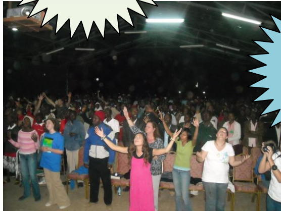
Over 600 Youth at Camp Praising God

Taught and counseled in a rural youth camp, spon- soring two attendees