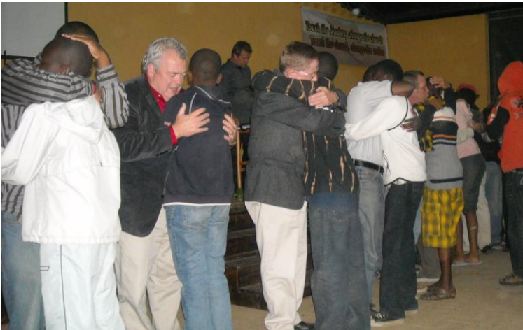
Youth receiving healing from father abuses by God's love

Taught and counseled in a rural youth camp, spon- soring two attendees